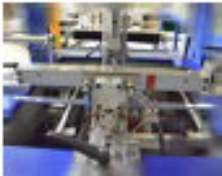
Easy and quick adjustment and running with high quality pneumatic cylinders