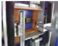
4 corner pressure synchronise system