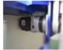
Panasonic servo drive motor for accurate synchronization