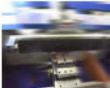
Smooth flap brushing wheels for smooth finishing