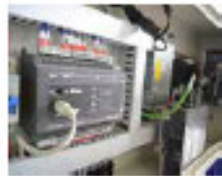
Panasonic servo motor with delta drive system