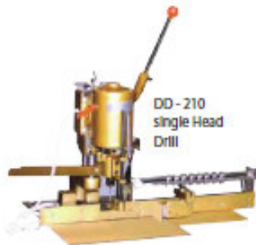
DD - 210 single Head Drill