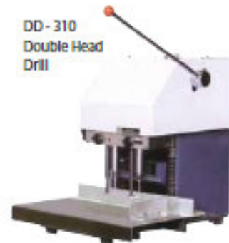
DD - 310 Double Head Drill

Remarks: Specifications listed above are for refer only and be subjected to changes without any prior notice.