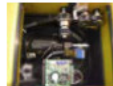
Enhance encoder system working with pattern controller

Remarks: Specifications listed above are for refer only and be subjected to changes without any prior notice.