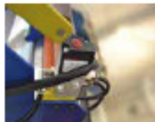
High standard solenoid valve for smooth running and quick releasing