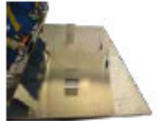
Easy receiving system ensures paper collection more regular and convenient