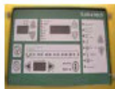
High quality tape pattern controller from ROBATECH