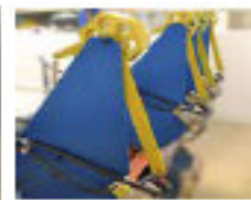
Patent tape applicator head for dispensing tape onto a working surface