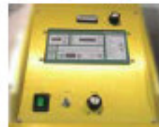
Control panel consists of counter, speed, sensor and power control