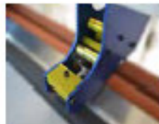
Easy tape guides for setting the width of the tape